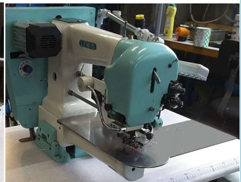
L-type: for ties