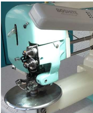
Round: original Lewis model

At your choice, the machine can be equipped with different types of work table: