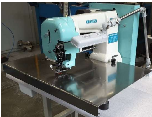
Large and rectangular: for scarves